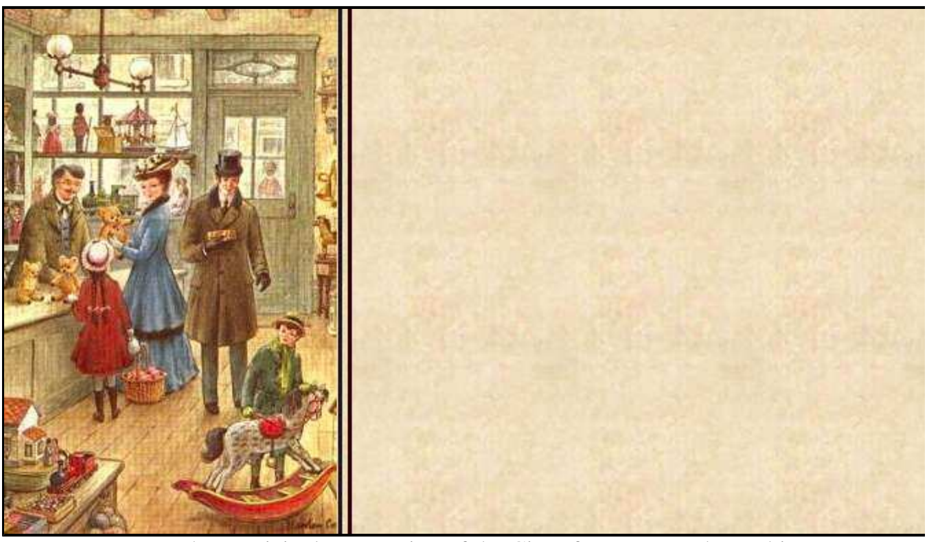
Keep your eye on the municipal corporation of the City of Leavenworth Washington

The Legal Fiction of Ordinances & codes Upon Natural Born state Citizens Subject: